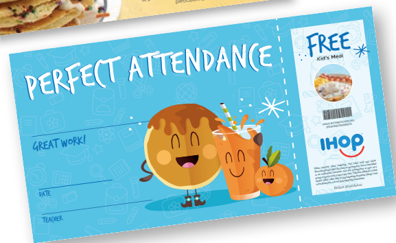
Top left: A collaboration between the Cardinals, Albertsons and Safeway, this scratcher was a big hit with fans at the Cardinals/Bears game. Bottom left: These custom die-cut mini trucks helped promote the #UHAULFAMOUS social media initiative. Middle and top right: A few pieces from the IHOP Back-to-School Incentive Program for hardworking students and educators alike.