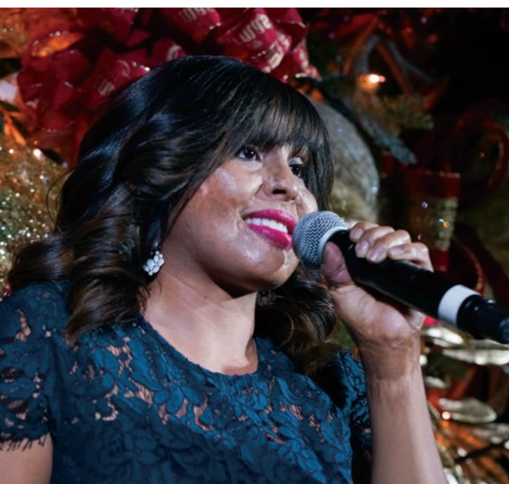
Images from Camp Courage and the Annual Holiday Festival of Trees.

WHAT DO A loveable dog and an inquisitive hummingbird know about teaching children how to prevent burn injuries and be fire safe in their homes? As it turns out, everything.